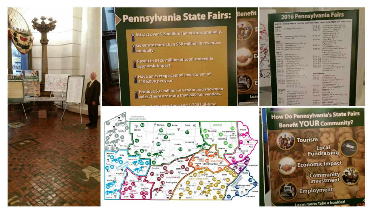
Thank you, Rep. Millard! Your dedication to PSACF means so much!

The Pennsylvania Capitol building now features an educational display about the Commonwealth's County Fairs! The display was created by our faithful supporter, Rep. Dave Millard (R - Columbia), who is continuing to fight for $4 million (or more) in fair funding during the current 2016 budget negotiations. The display highlights the popularity of fairs, their benefits to the community, the economic advantages to the state, a map show casing the location of each fair, and a poster advertising the dates and duration of each fair. Likewise, Rep. Millard had special brochures made so viewers could take the information home, further discovering the advantages county fairs offer to the state when they are adequately funded.