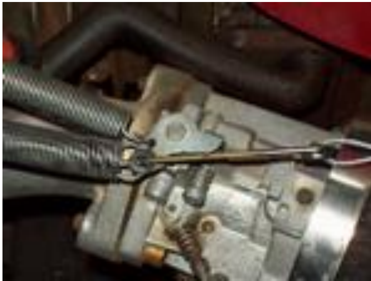
Photo 2: Notice that the springs are attached to the same bracket this is incorrect! They must be mounted on two separate mounting brackets. This way if for any reason one breaks you will still have one spring attached. For V-twins and different style carburetors' used on FX's, the same principle must be used. For example FX's using Mikuni or the CV style Keihin Carburetors the Slide Spring can count as one return spring and you must have a separate external spring attached as the safety spring.