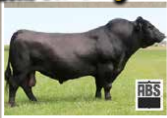
QUAKER HILL RAMPAGE 0A36