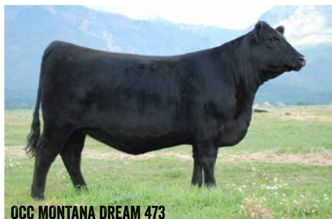
OCC MONTANA DREAM 473

OCC Montana Dream 473 is a Final Product daughter that was a class winner and went on to be the Reserve Heifer Calf Champion at the 2014 NILE ROV Show in Billings, Montana. In 2015 she was selected as the Overall Grand Champion Angus Female at the NILE Junior Show in Billings.