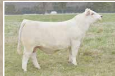
WC CCC RESOURCE 417P