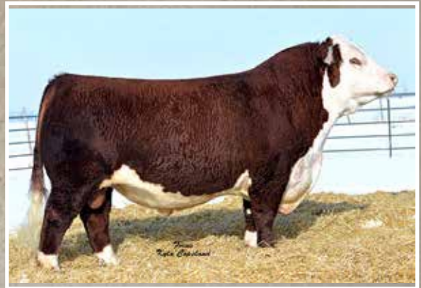
CRR 713 CATAPULT 109