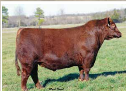
BROWN JYJ REDEMPTION Y1334