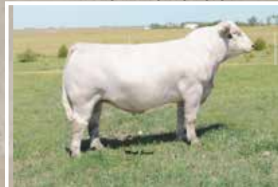
TR DSUL WS 100 PROOF B24