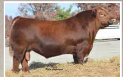
SILVEIRAS MISSION NEXUS 1378