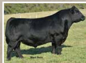
PVF INSIGHT 0129