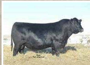
BASIN PAYWEIGHT 1682