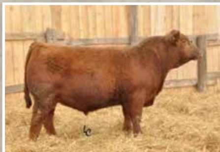
BIEBER FAF ROLLIN DEEP B627