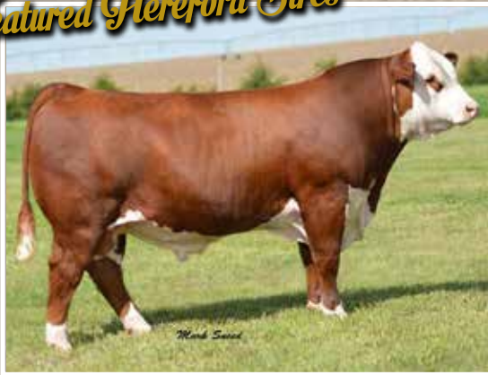
R LEADER 6964