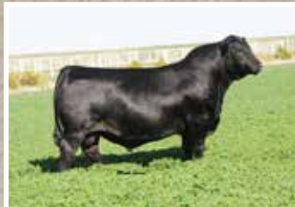
PRAIRIE PRIDE NEXT STEP 2036