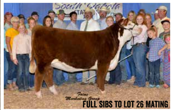
FULL SIBS TO LOT 26 MATING