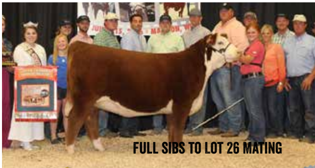
FULL SIBS TO LOT 26 MATING