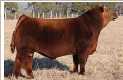
RED SOO LINE POWER EYE 161X