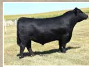
STYLES CASHED IN