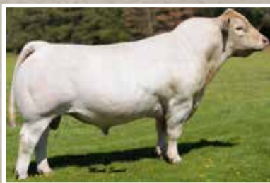
R MR FIREWATER 5792RET