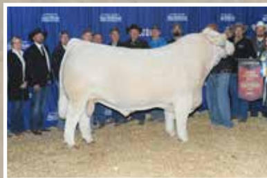
PCC ROME 437B