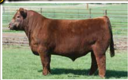
PZC TMS FIRESTORM 1800 ET