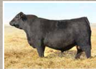
HA COWBOY UP 5405