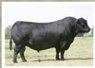
SAV FINAL ANSWER 0035