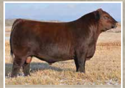
SIX MILE SIGNATURE 295B