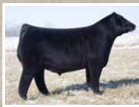
BC II MLA NEXT UP 015