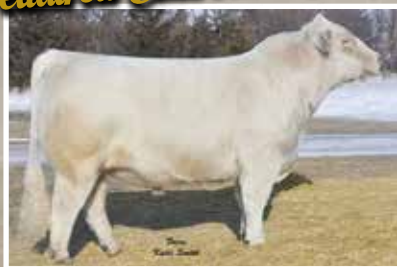
TR MR WRANGLER UP 2502Z