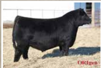
BROOKING BANK NOTE 4040