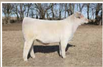
M&M OUTSIDER 4003P